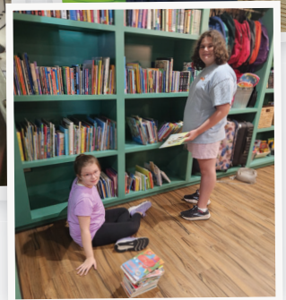
Women of FBC gathered together to help with The Bloom Closet's seasonal reset.